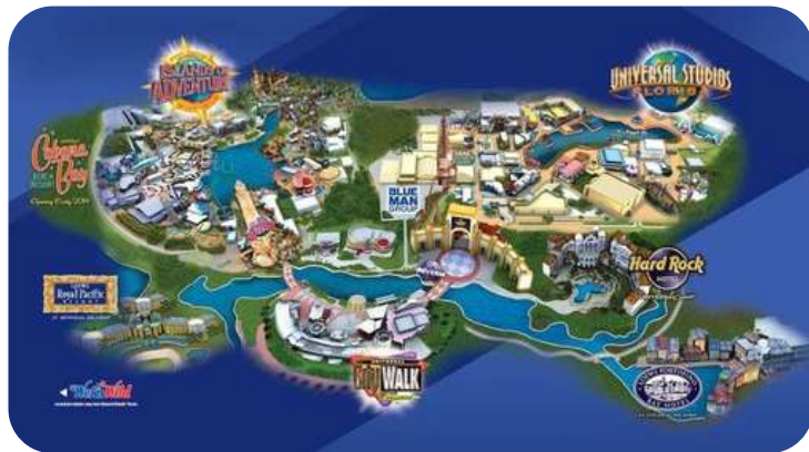
Map Of Universal Studios, Orlando, Florida

Meal: Breakfast + Lunch + Dinner (Included)