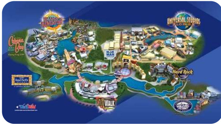
Map Of Universal Studios, Orlando, Florida

Meal: Breakfast + Lunch + Dinner (Included)